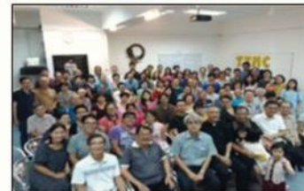
28 Nov 2017: The birth of TTMC and Constituting Church Conference