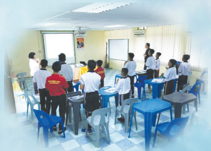
BB at SMK Tabuan Jaya