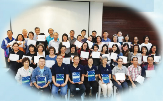
"Lead Like Jesus" Course

Christian Education (CE) is the foundation for lifelong learning and growth towards maturity in our Christian faith. It provides resources and courses to equip believers to grow in the grace and knowledge of our Lord Jesus Christ through His Words, thus we become faithful followers that God calls us to be, develop our spiritual gifts and strengths to encourage and lead others to grow in Christ.