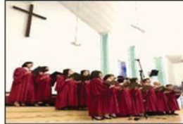
Mar 2018: TTMC Choir formed