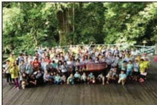
Aug 2017 TMCJS First Family Day Outing