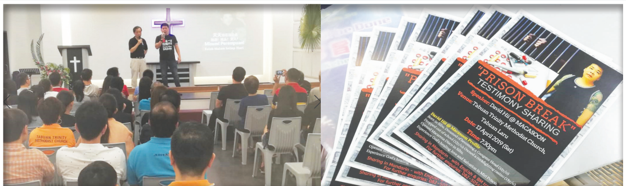
TTMC hosted the testimonial sharing by bro. Hii Daw Soon on the evening of 13 th April 2019 specially for the youths in Kuching