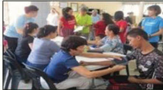
Sept 2018: Medical Mission to Kg Sg Tb Laru