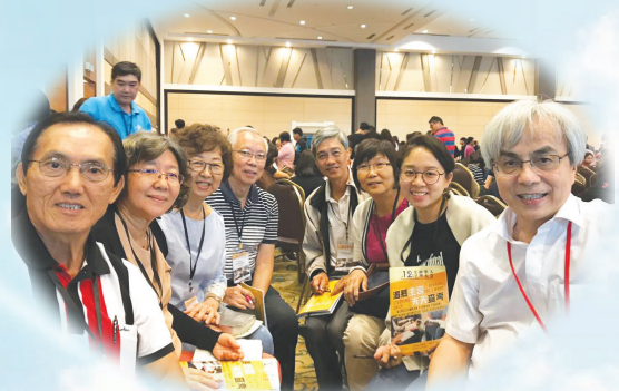
SCAC Methodist Convention in Sibiu