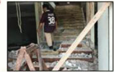
Aug 2018: Demolishing and construction of new staircase