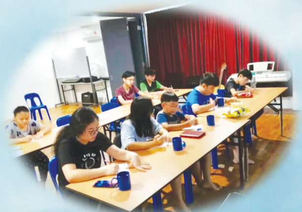
The youth listened attentively to a briefing by their leader at the Fellowship Hall at TTMC