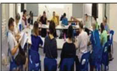
Oct 2015 TMC Protom Committee Meeting