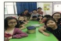
10 Jan 2016 Sunday School started