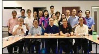
Jan 2018: TTMC 1 st Local Conference