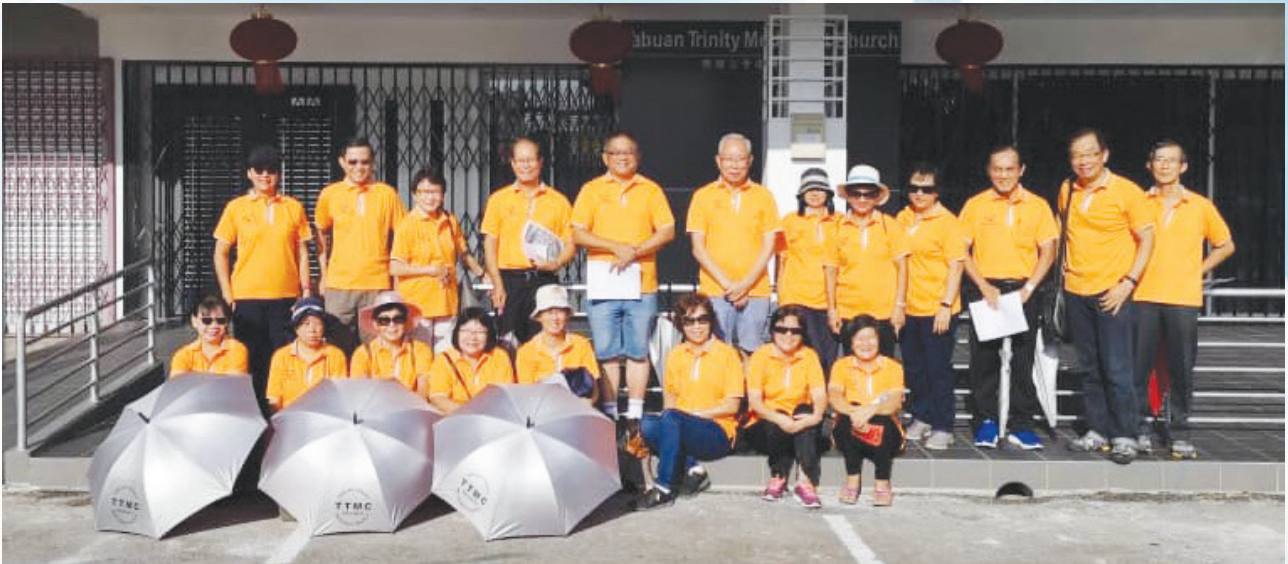
Preparing to distribute invitation leaflets