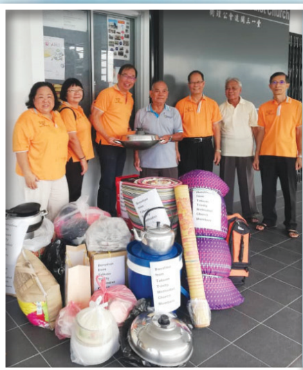
Donation to the fire victims of Pantu Longhouse