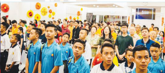
Praise and Worship