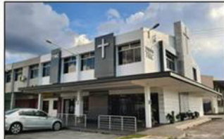
Jan 2019: Renovated, furnished & handed over