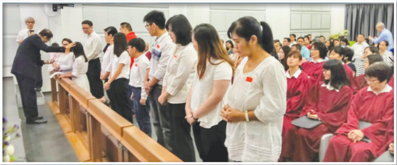
Baptism and Confirmation