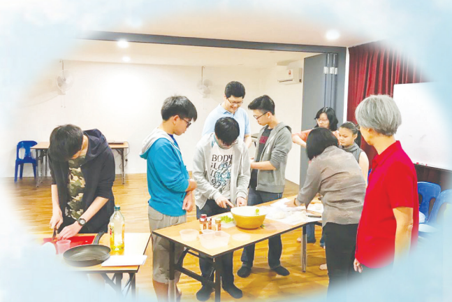
The youth learned how to "cook with the Bible" assisted by church leaders