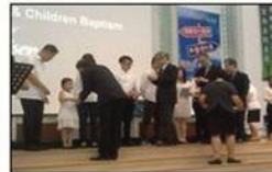
14 Aug 2016 First Baptism and Confirmation