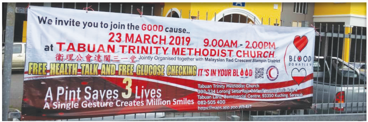
Blood donation campaign jointly organised by TTMC with Stampin District Malaysian Red Crescent Society on 23 rd March 2019

In line with TTMC's mission – to be and make disciples of Christ, the Christian Social Concern Ministry in collaboration with other ministries like Membership & Evangelism, Mission & Medical Outreach has organised various activities. Just to mention a few like the blood donation drive and a sharing on the danger of drugs. The objective of the ministry is to reach out intentionally to care and show concern to our church members/worshippers and the Tabuan communities in general.