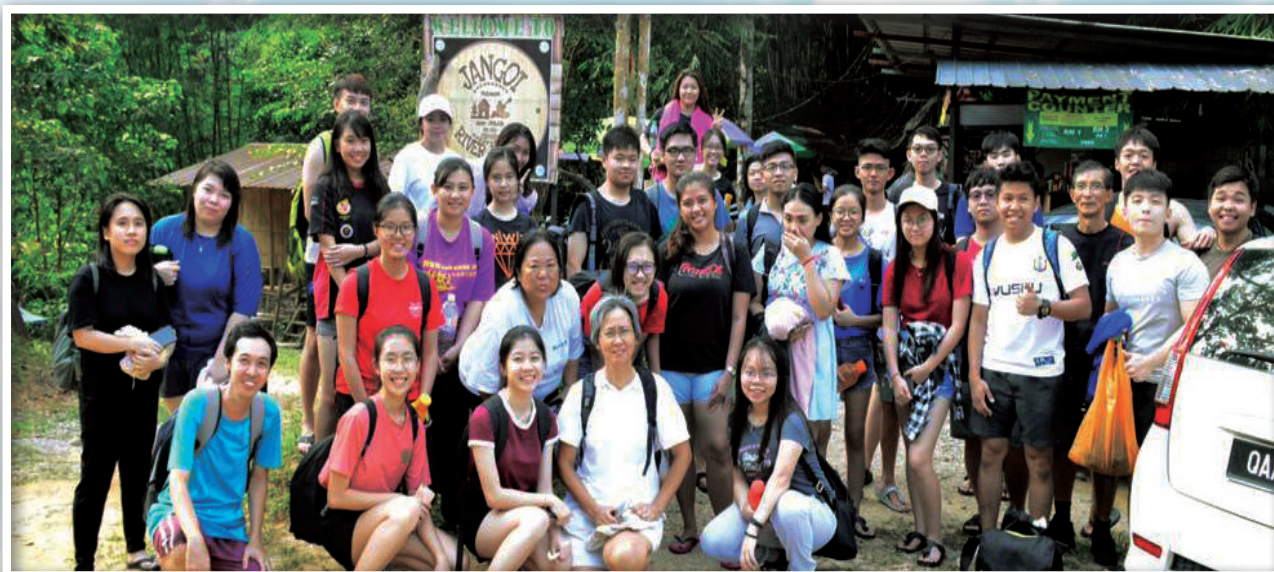
Sunway College Fellowship's outing to Jangoi River Lodge, Padawan