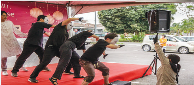
Skit from Korean Team