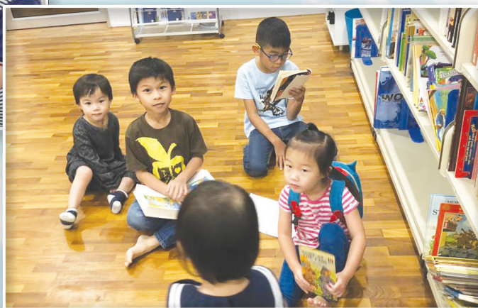
Children's Reading Corner