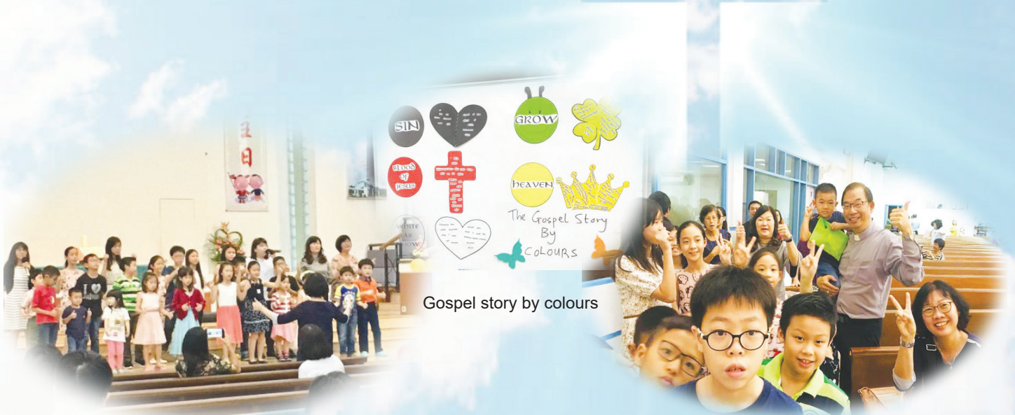
Sunday School Children presented a song titled "God is Good" on Sunday School Sunday, June 30 th , 2019

Our mission statement is, "Reaching children with the gospel and bringing them up as disciples." We nurture our Sunday School children by teaching them the life changing truth of the Bible through Bible content and related interactive activities. Praise and worship is also an integral part of Sunday School. The children learn to personally experience spiritual development and build up godly character. They enjoy friendship and fellowship with their peers.