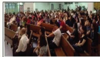
3 Jan 2016 TMCJS Inaugural Service