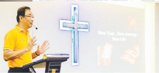
New Year, New Journey, New Life