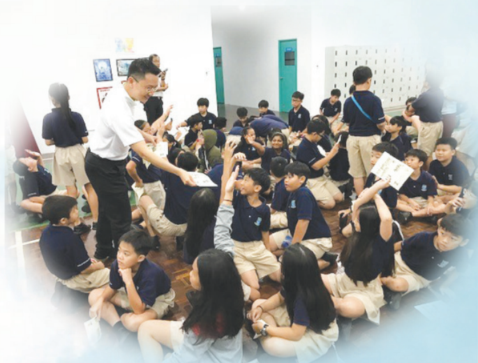
BB at Borneo International School