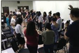
Apr 2018 Sunway College Fellowship