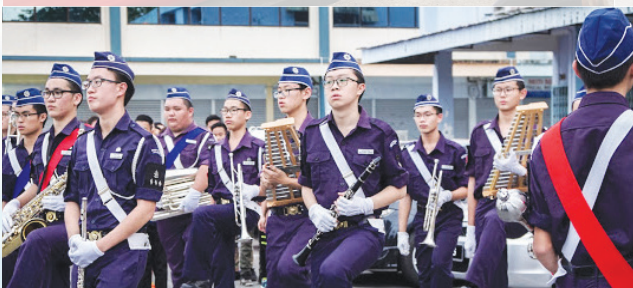
BB March past