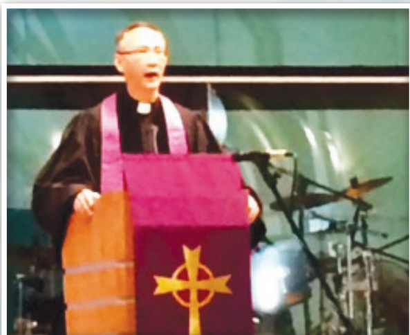
A Service For Organizing a new Congregation