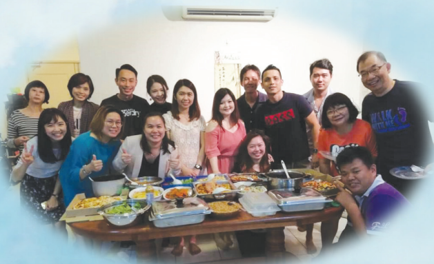
Young Adults Group