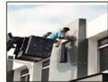
Dec 2018: Putting up of "The Cross"