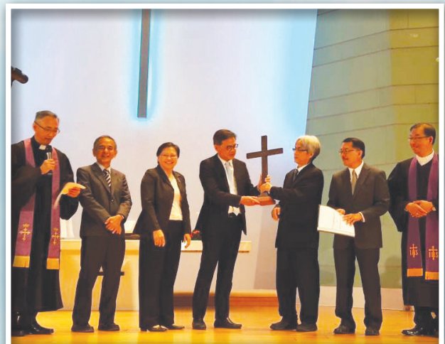
Commissioning a new congregation