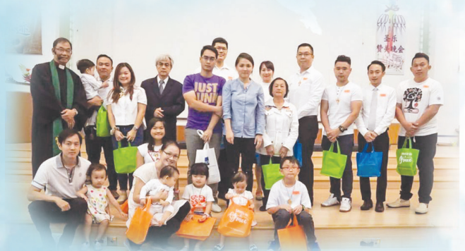
Baptism and Confirmation Ceremony 2018

When Tabuan Trinity Methodist Church became a full church in November 2017, we had 111 full members. As time goes by, we have grown to have 157 members of which 143 of them are full members as of August 2019. The attendance of our morning service at Tabuan Laru was averaging 90 to 100 people while for the evening service at Chin Daw Methodist Church, we had about 160 to 170 worshippers. As part of our vision which is to become a growing communal church, we would like our members and worshippers to participate in church life and grow in maturity in Christ. We also want to see more of our members joining small groups so that they can build up their faith through Bible study and fellowship. Likewise, we will continue to reach out to non-believers so that they will get to know Jesus Christ our Lord through evangelistic sermons, special events, visitation and prayers as well as sharing of testimonies.