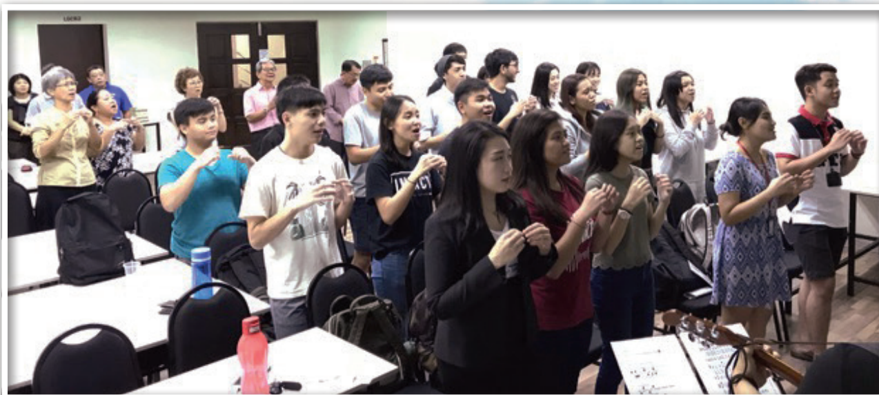
Student Fellowship Meeting