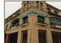
Apr 2016 Opening of TMCJS office