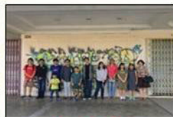
March 2017 Youth Ministry formed