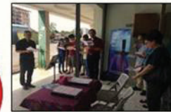
June 2018: Renovation Blessing Ceremony