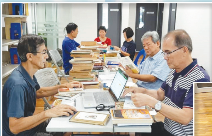
Life Long Learning

T hy word is a lamp unto my feet, and a light unto my path."