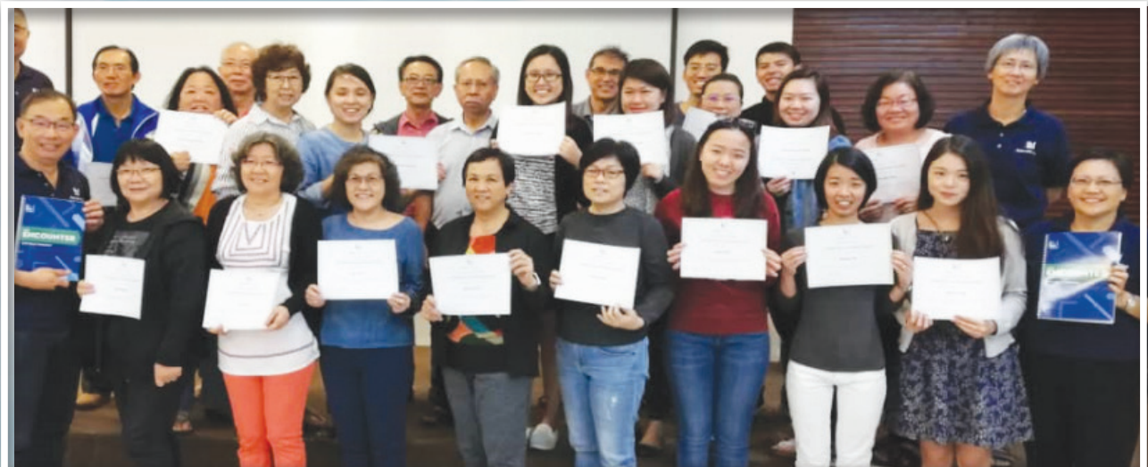
Lead Like Jesus